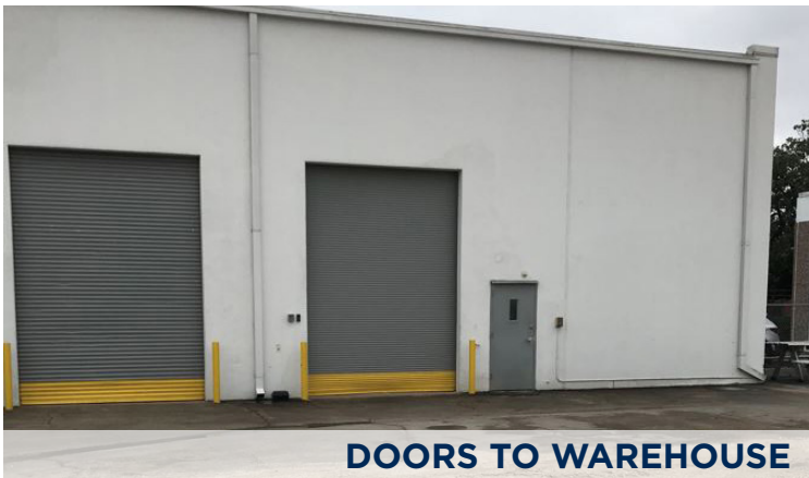
DOORS TO WAREHOUSE